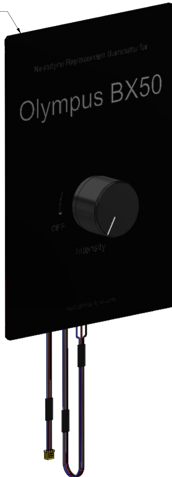
PN 10584 Olympus BX50 Pot Plate Cable Assembly