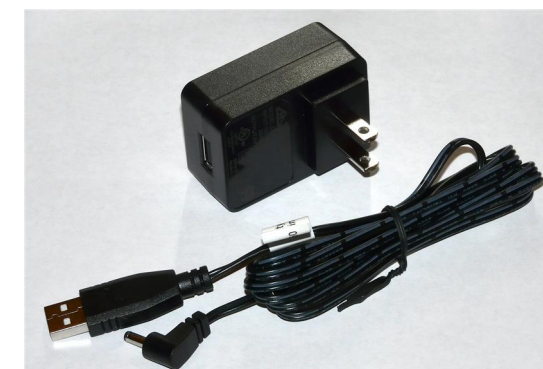
PN 11163 Power Supply 5V 2.1A and PN 10734 Power Cable 1.35mm ID/3.5mm OD x USB A 6 ft.

The illuminator may be powered by plugging the cable into the power supply provided, or into a suitable USB port on a computer or other device.