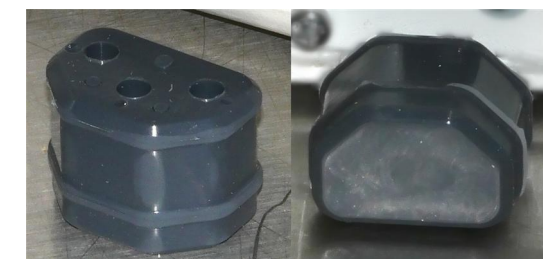
PN 10736 Rubber plug to block unused AC power receptacle.